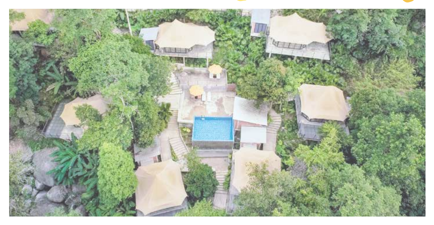
Written by Dennis De Lira

Glamping, a fusion of glamour and camping, where beautiful nature meets modern luxury. A unique way to experience untamed and utterly exceptional parts of the world—without sacrificing creature comforts.