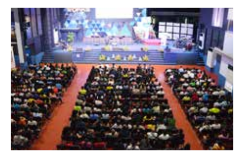
Aerial view of the jam-packed venue with more than 700 attendees in Word of Hope, Quezon City.